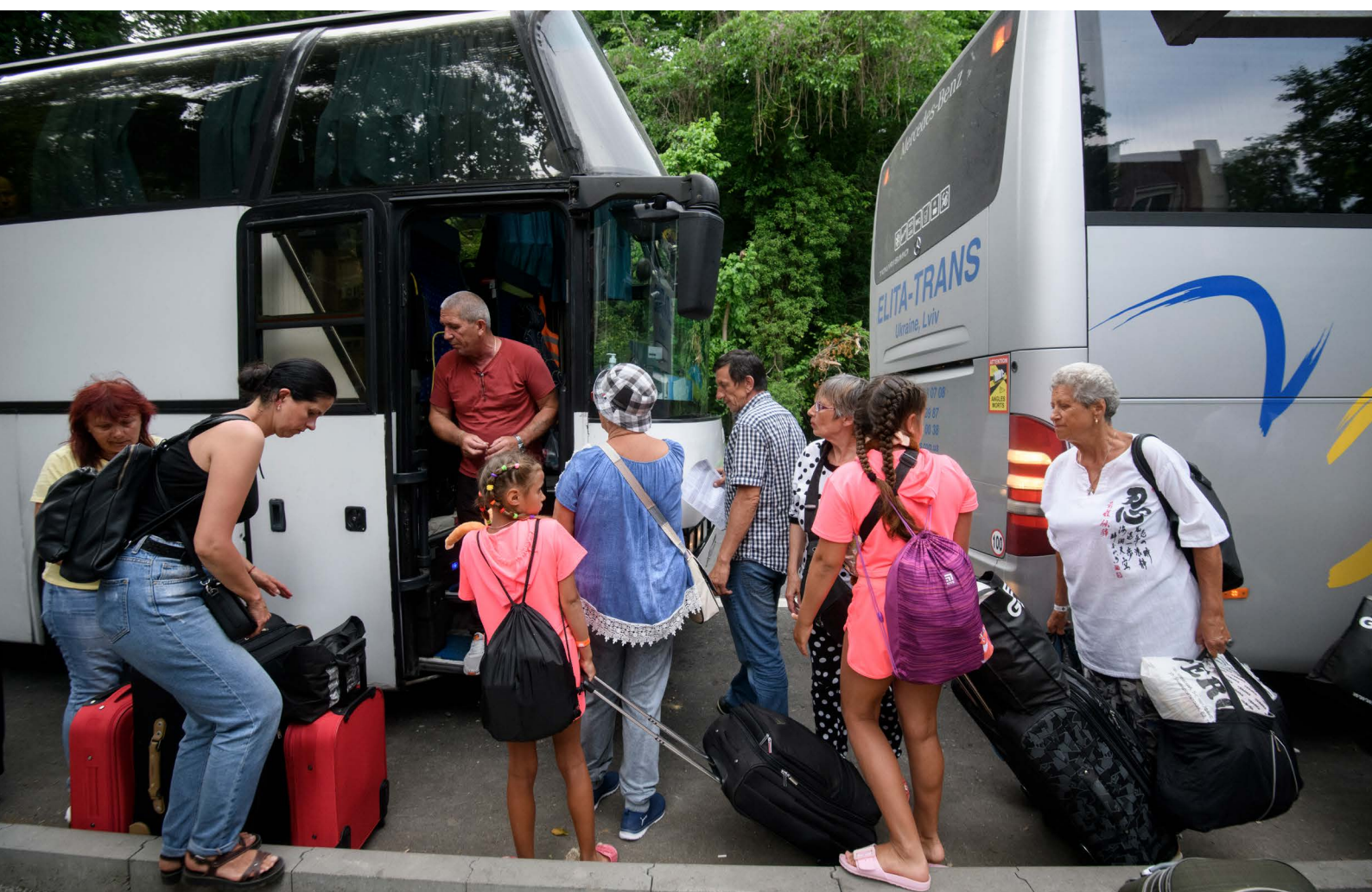
Ukrainian refugees in Bulgaria are returning back to Ukraine, June 2022