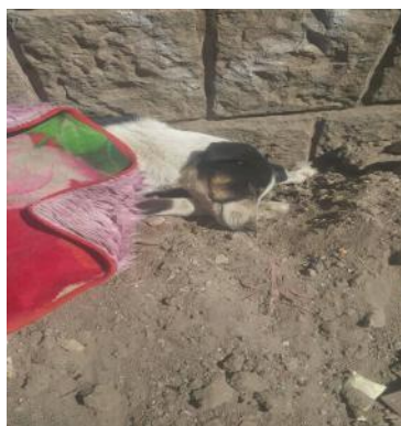
stray dog with paralyzed hind legs