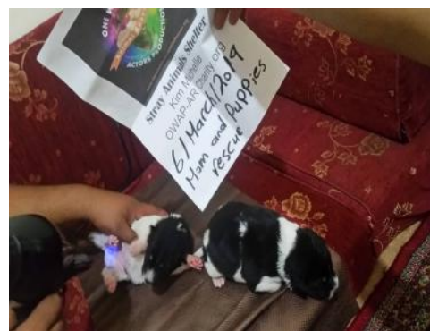
stray street puppies

Assoc. OWAP(-AR), Le Petit Languernais , 31 rue de La Buterne, 44350 SAINT MOLE, France email : oneworldactorsanimalrescues@gmail.com ,